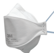
3M™ Aura™ Particulate Respirator 9320+