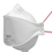
3M™ Aura™ Particulate Respirator 9330+