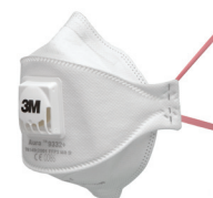
3M™ Aura™ Particulate Respirator 9332+