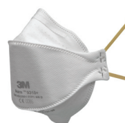
3M™ Aura™ Particulate Respirator 9310+