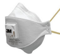
3M™ Aura™ Particulate Respirator 9312+