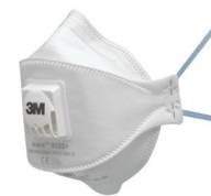
3M™ Aura™ Particulate Respirator 9322+