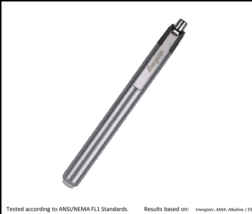
Tested according to ANSI/NEMA FL1 Standards. Results based on: Energizer ® MAX, Alkaline / E92